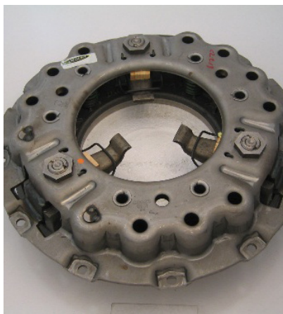
135 0002 WH-L 135 0003 WH-L