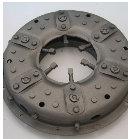
135 0002 WH (original>Long)

Ag Clutch has two variations of clutch covers available to replace the original "Long" style used in some applications. The clutch covers may vary slightly in appearance. For example the lever and spring arrangement, however these covers are completely interchangeable without the need for any special modification.