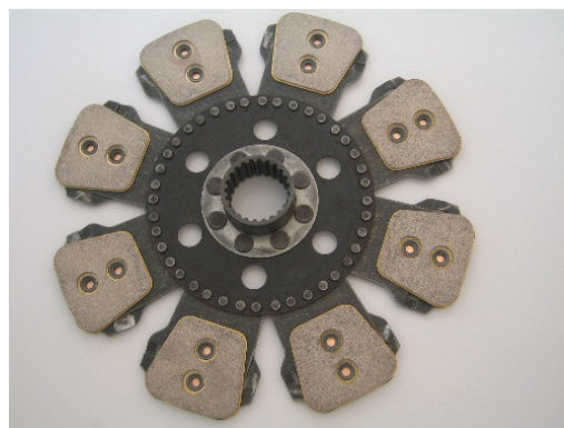
135 0003 MF

Ag Clutch can supply the same original style Valeo clutch as well as an aftermarket LuK type. We recommend these be installed as a mated set.