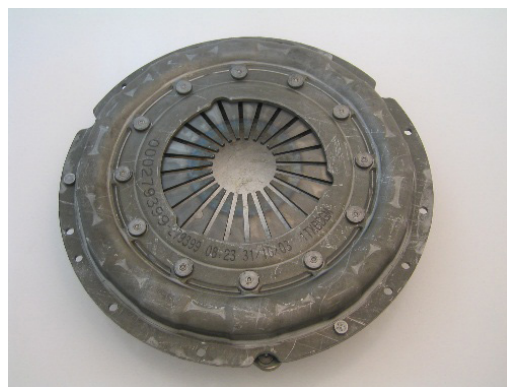
135 0003 MF