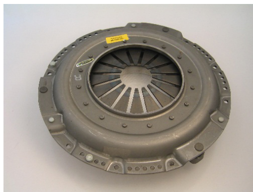
135 0003 MF