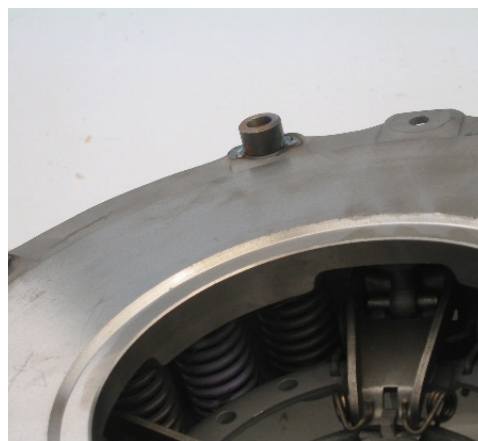
128 0012 MA (12mm spacer) 328 1012 MA-DCO (12.5mm thick)

The 280mm lever & spring assemblies shown above are designed with specific thickness cover spacers and must be therefore be mated to the correct thickness discs listed above.