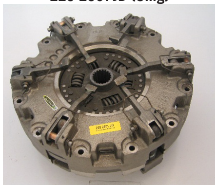
228 2801 JD (Omg)

The original assembly has both main and PTO discs integrally fitted