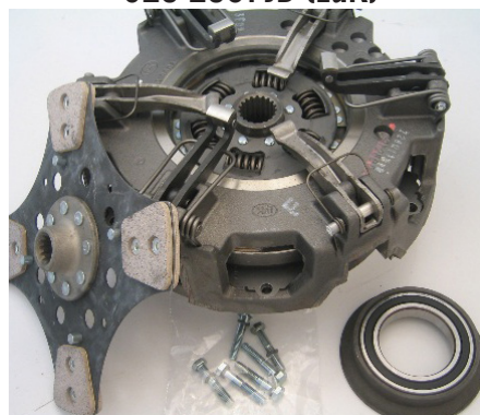
628 2801 JD (LuK)

The LuK aftermarket assembly has integral main and loose PTO discs