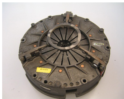
Original 310mm assembly