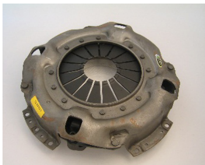
133 0001 FO (AP)

Details > with 330mm diaphragm type cover assembly CLUTCH PLATE and COVER COMPATIBILITY Ag Clutch Part Numbers >