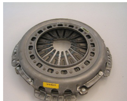
133 0002 FO (LuK)

The clutch disc shown above is designed with a heavy duty hub configuration and is only used in conjunction with the two covers listed.