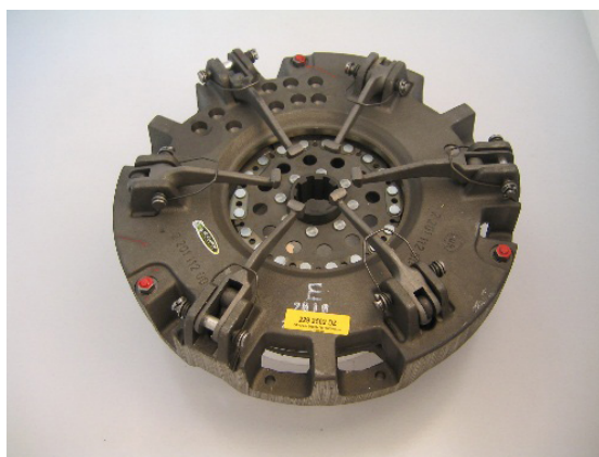
229 2502 DZ -36mm

Ag Clutch recommends complete clutch component replacement only including the correct restoration or renewal of the flywheel.